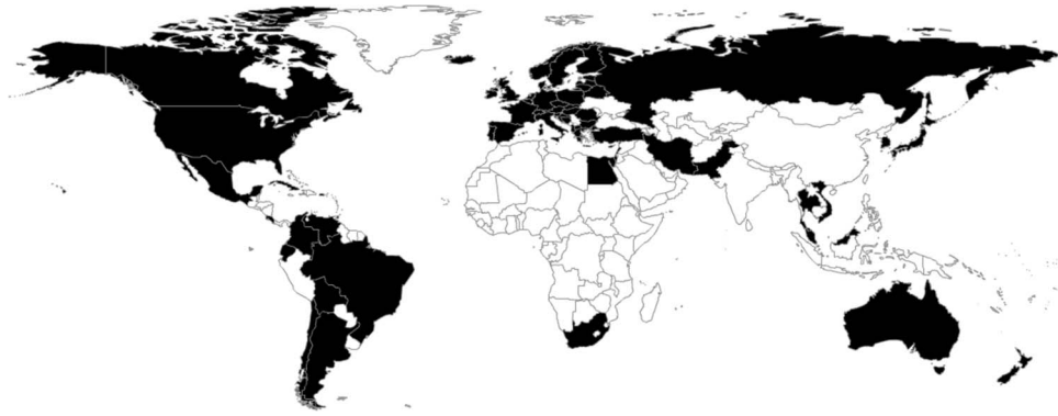
Figure 1. Nations analyzed (shown in black) by the criteria of n > 50 responses per nation and > 5\% Internet user population.

participants' computers; this limitation introduced some random noise into the implicit measure, but no large systematic biases (Nosek, Greenwald, & Banaji, 2005). Each participant completed a block of 60 stereotype-consistent trials and a block of 60 stereotype-inconsistent trials. The ordering of stereotype-consistent and stereotype-inconsistent blocks can have weak to moderate effects on the magnitude of implicit bias (Nosek et al., 2005, Study 4). The ordering of these blocks was therefore counterbalanced across participants. Before completing these critical blocks, participants completed a practice block of 20 trials that involved categorizing only male and female words and then another practice block of 20 trials that involved categorizing only science and liberal arts words. These practice blocks helped participants become familiar with the IAT, consistent with standard practices for administering this task (Nosek et al., 2005).