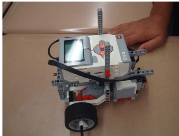
Figure 1: A base robot developed using the LEGO Mindstorms EV3 robotics kit to teach middle school STEM lessons.

large electric motors to provide powerful and precise action and motion of the robotic vehicle under through appropriate program and control; (iii) several useful sensors such as ultrasonic, touch, color, temperature, wheel rotation, gyroscope, etc.; and (iv) two wheels of appropriate sizes, several gears, different types of cables, and various configuration parts and accessories to build the robot structure as required. We used the LEGO Mindstorms EV3 robotics kit being convinced of its relatively affordable cost, easy programming and operations, simple troubleshooting, flexibility in assembly, configuration, and reconfiguration, easy power supply, easy storage, and appropriateness of its functions and capabilities in explaining middle school science and math content [2-3,9-12,26].