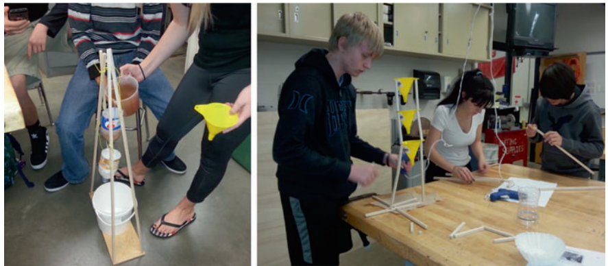
Fig. 3 Water unit students designing filtering systems